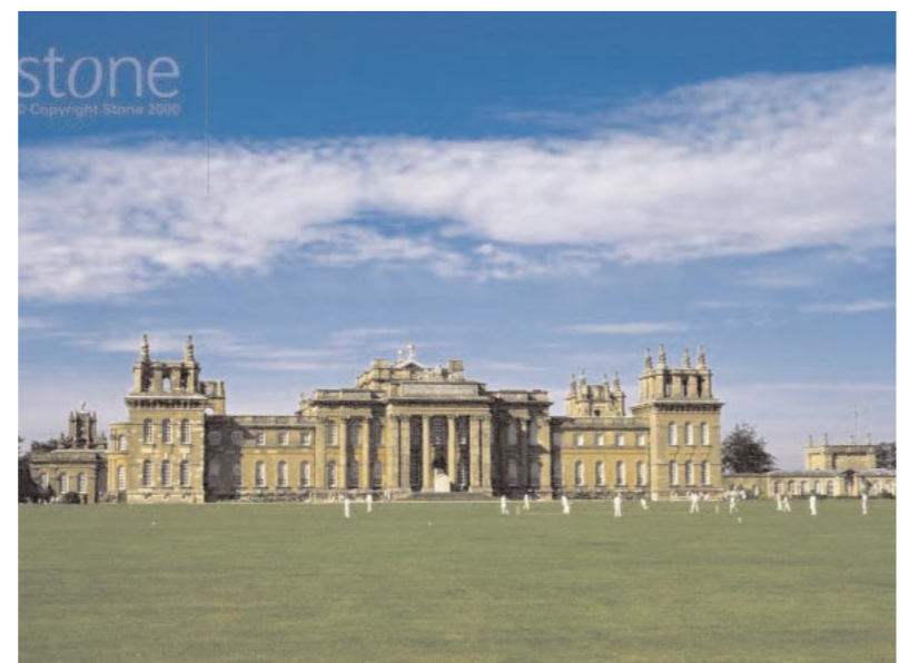
BLENHIM: how to get there, what to see this time of year, opening times, price of admission etc

So whichever area of the outdoors you're exploring, go for the great escape and try and a great estate!