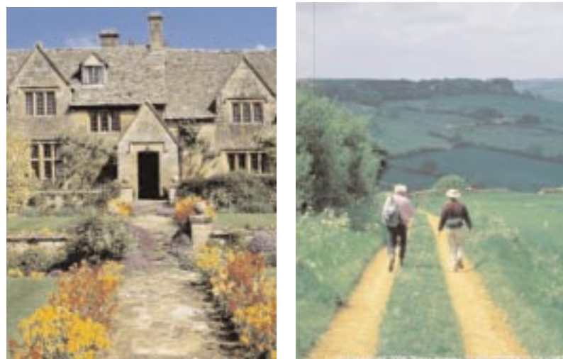
THE COTSWOLDS: how to get there, what to see this time of year, opening times, price of admission etc

Discover the spaciousness of a Vauxhall Estate during a test drive and receive a free travel guide to Great Britain helping you make the most of great space outdoors.