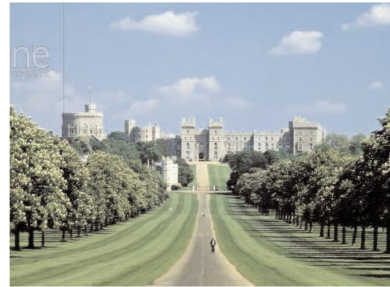
WINDSOR: how to get there, what to see this time of year, opening times, price of admission etc