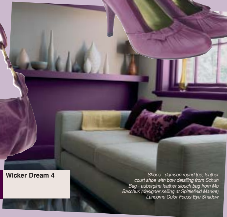
Shoes - damson round toe, leather court shoe with bow detailing from Schuh Bag - aubergine leather slouch bag from Mo Bacchus (designer selling at Spittlefield Market) Lancome Color Focus Eye Shadow