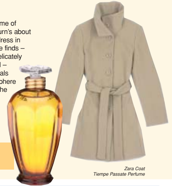
Zara Coat Tiempe Passate Perfume