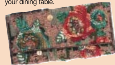
Yin brown suede calf length boots Accessorize brown sequined clutch bag

If there's one thing you know how to do, it's how to have a good time. You can't help but light up the room with your exuberant, eclectic style: you're hot on the heels of boho princesses Sienna Miller and Kate Moss, teaming fabulous vintage finds with modern girl pieces. Skinny jeans and suede boots with a Thirties tea dress; a distressed wrought iron bed swathed in a gilt-beaded Megan Park throw. And you can never resist a bit of razzle dazzle in your daily life – sequins on your handbag, crystal on your dining table.